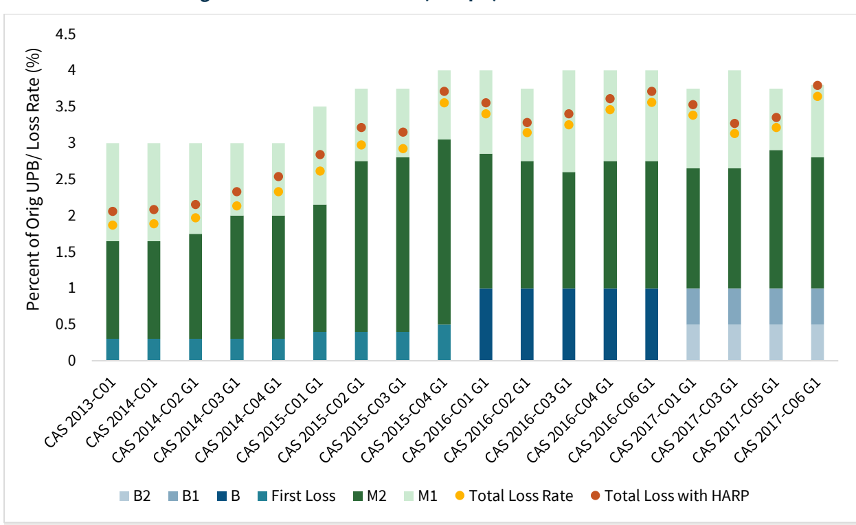
Chart 2: Net Loss Re-Weighted to 2006 Performance (Group 1)

For outstanding CAS and CIRT deals, whose reference pools are not eligible for HARP (and will not be eligible for the high LTV refinance option) this means that aggregate loss exposure may be marginally higher than the level represented by using the primary data set alone, which did not include the post-HARP performance. But as represented in the charts below, the magnitude of the difference is small, even in the tail vintages.